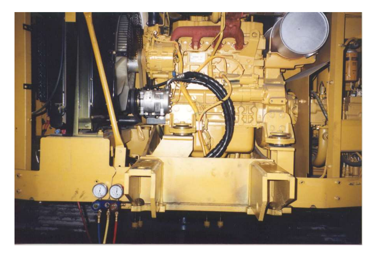
Compressor in place with hoses routed. **NOTE** Counterweight does not have to be removed.

Install the compressor mount onto the engine just below the alternator. This is the same mount location as the factory would use. Use the metric hardware provided in the kit. Set the compressor into the tightener ears on the mount. Loosely bolt the compressor in place with the fittings pointing up. Install the drive belt and use a straight edge across the pulley face to check the belt alignment. Tension the belt and tighten the compressor bolts.