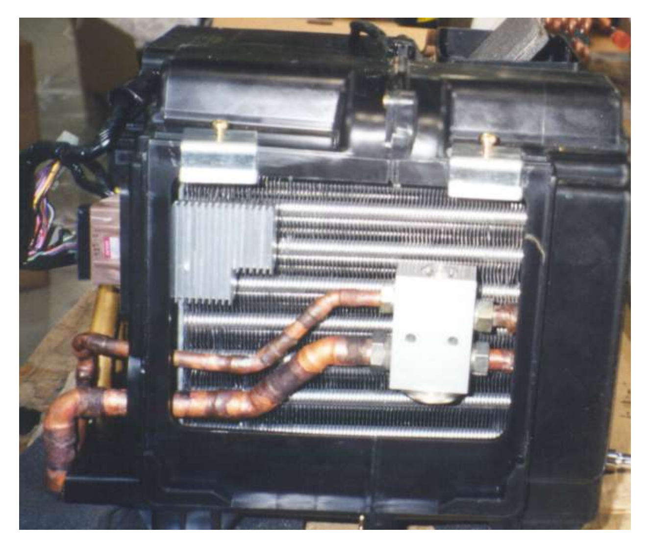
View of evaporator face showing expansion valve and supply lines out of box.

Before fitting the evaporator into the box alongside the heater core, remove any plugs from the drain holes and ensure they can drain outside properly. Mount the evaporator into place with the copper lines extending out through the knockouts in the plastic casing. The evaporator is held in place by friction fit, so ensure the foam is in place around the coil.