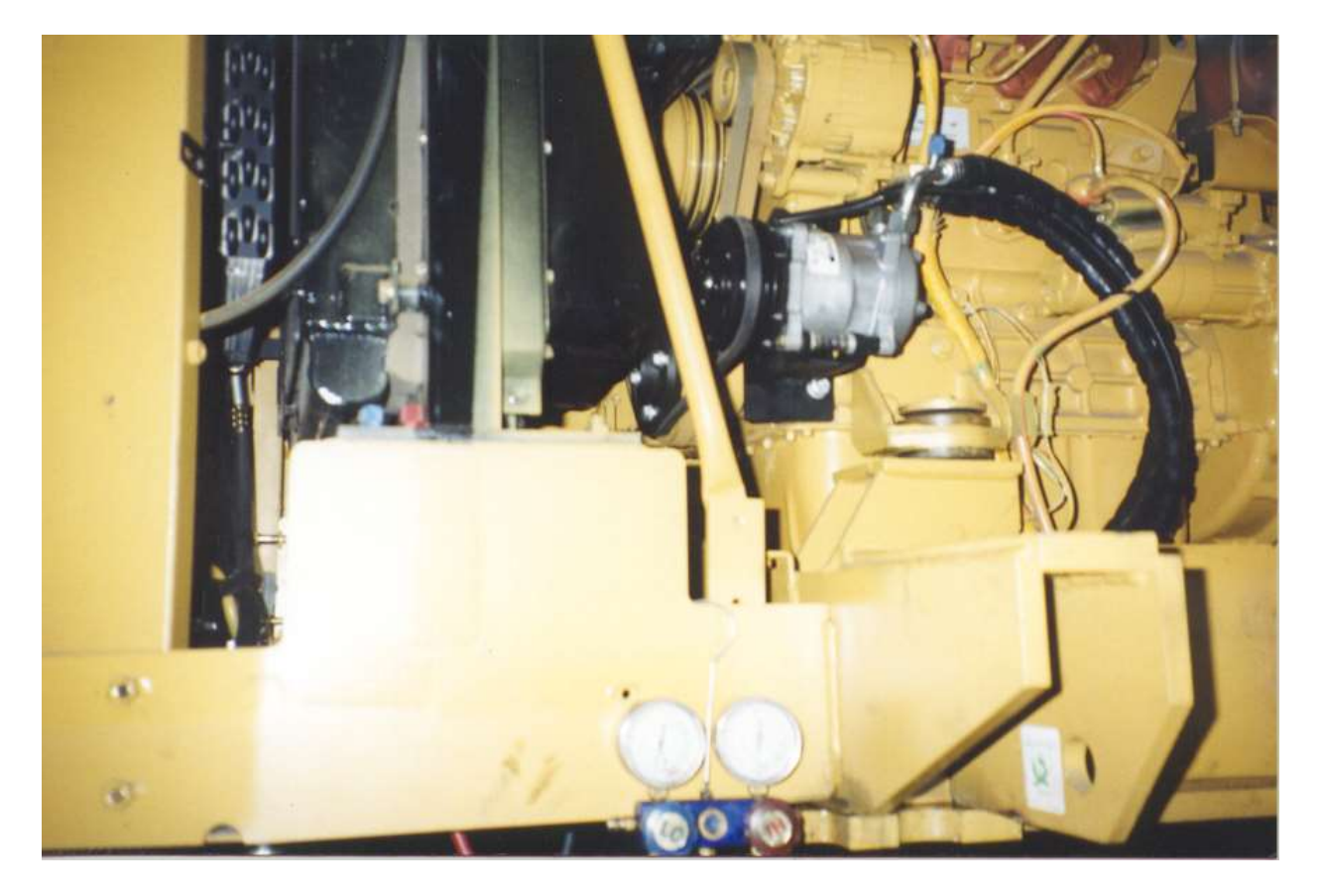
Compressor mount and drive in place on 311/312 Cat. **NOTE** Counterweight does not have to be removed.

Mount the compressor mount onto the location shown for the factory assembly using the metric hardware provided. Do not tighten the mounting hardware down completely until checking the alignment with the compressor in place. Once the alignment is checked, tighten down the bolts and mount the compressor. Place the drive belt in place and tighten up the compressor to take up the tension.