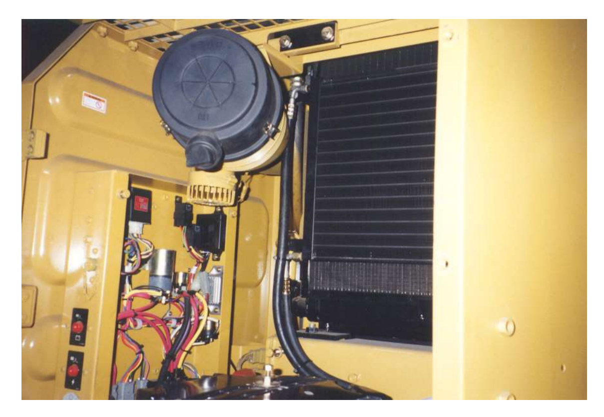
Fitting side of condenser in place.

The condenser is configured for mounting on the radiator as shown in the pictures. The left (fitting side) brackets are designed to mount on 12ga stand off brackets bolted to existing holes using the existing hardware. The right side bracket bolts onto the flange, as shown in the picture, with the hardware provided. The receiver drier is mounted to the 900 bracket provided which is mounted on an existing bolt in the battery compartment below the radiator.