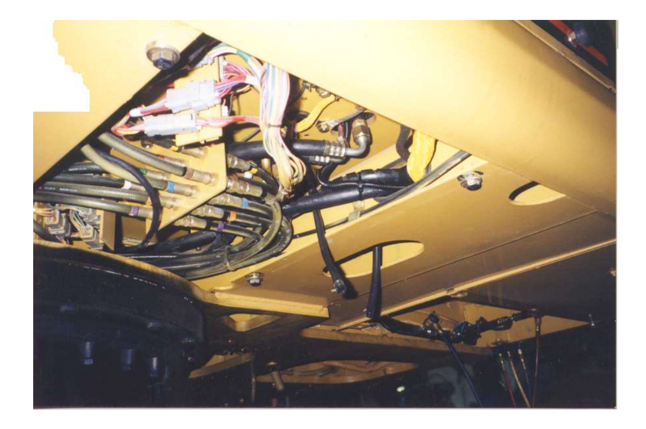
View showing underside of evaporator area with hose assemblies and drain tubes.