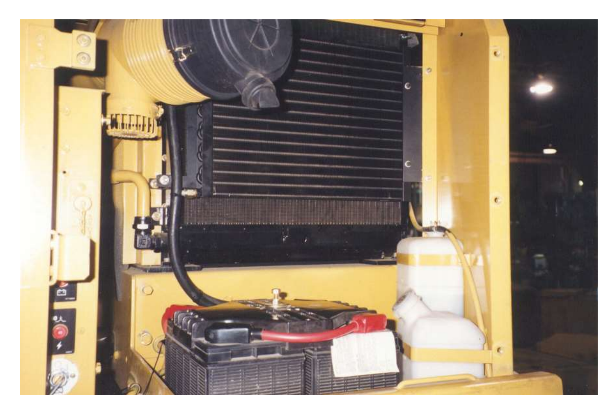
View of condenser in place on radiator.